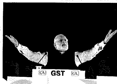
Honorable Prime Minister of India Shri. Narendra Modi delivers a power packed, insightful address on 68th foundation day of The Institute of Chartered Accountants of India

"THE NAME OF CA SHOULD BE EQUATED WITH COMPLIANCE AND ACCURACY..."