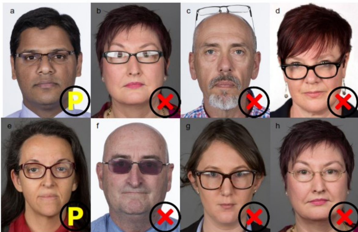
a) Compliant portrait, b) Strong reflections on glasses, c) Glasses worn on the head, d) Frame crossing the eyes, e) Compliant image, f) Sunglasses, g), h) Frames partially covering the EVZ.