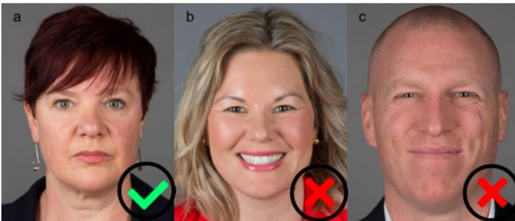
a) Compliant portrait, b) Smiling person, c) Person smiling with closed mouth.