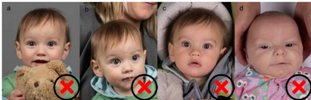
a) Toy, b) supporting person, c) Non-neutral background, d) Supporting hands.