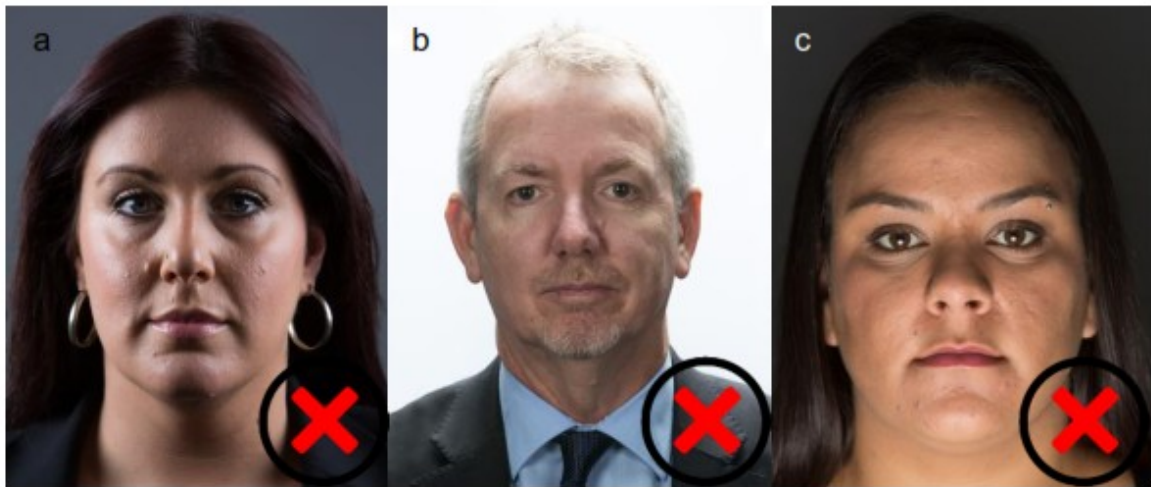
Non-compliant portraits: a) Side illumination, b) Top illumination, c) Bottom illumination.