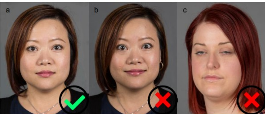
a) Compliant portrait, b) Unnaturally wide opened eyes, c) Eyes not fully opened.