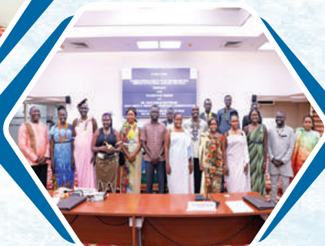
Diplomats from South Sudan in traditional attire