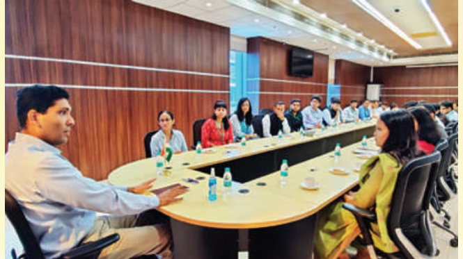
Visit to Regional Passport Office, Mumbai