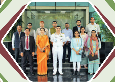
Visit to IFC-IOR