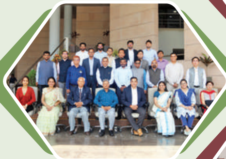
Visit to NFSU, Gandhinagar