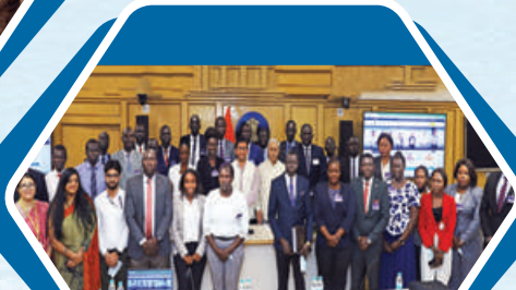
Visit to Election Commission of India