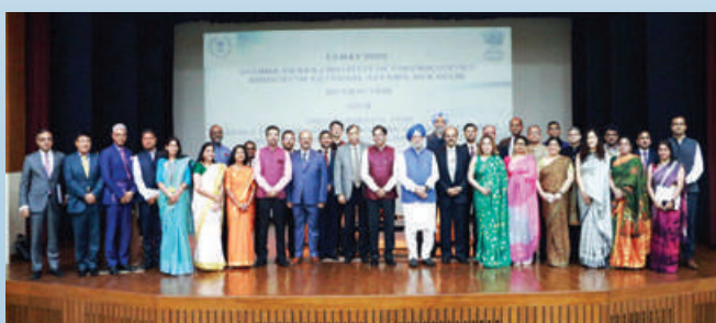
Address by Shri Hardeep Singh Puri, Minister for Petroleum & Natural Gas and Minister of Housing & Urban Affairs