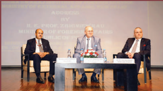
H.E. Mr. Zbigniew Rau, Foreign Minister of Poland visited SSIFS on 25 April 2022 and addressed the IFS OTs and Bhutanese diplomats.