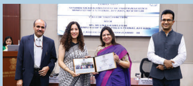
Smt. Meenakshi Lekhi, Minister of State for External Affairs & Culture, graced the Valedictory Ceremony