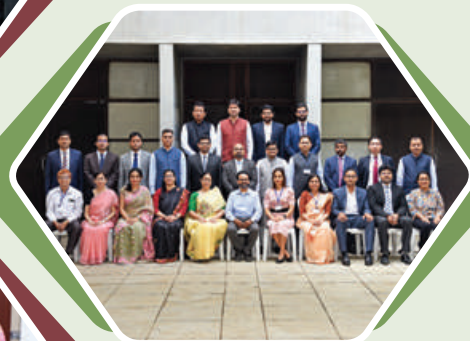
Visit to IIM Ahmedabad