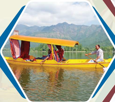
'Incredible India' through the eyes of IFS OTs during their Bharat Darshan