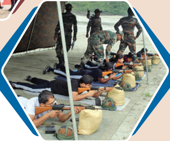
Army Attachment of IFS OTs