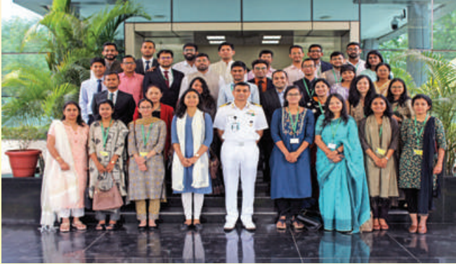
Visit to Information Fusion Centre-IOR