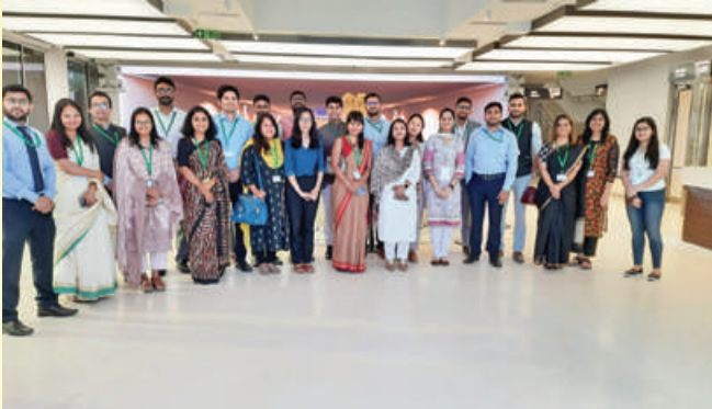
Visit to Pradhanmantri Sangrahalaya