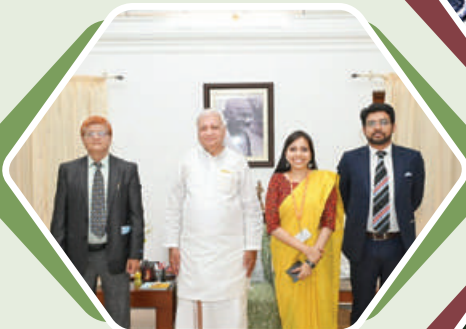
Calls on Hon'ble Governor of Kerala