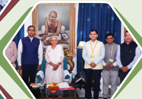
Calls on Hon'ble Governor of Uttar Pradesh