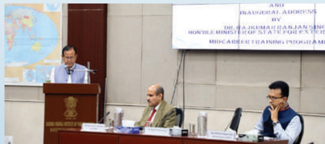
Inauguration of MCTP-III by Dr. Rajkumar Ranjan Singh, Minister of State for External Affairs & Education