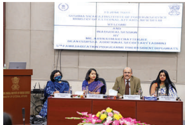
Inaugural session addressed by Dean (SSIFS)