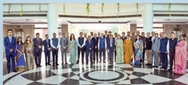
Call on External Affairs Minister, Dr. S. Jaishankar