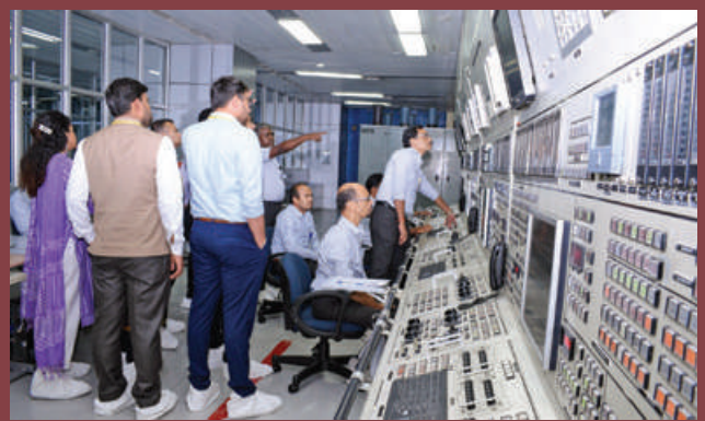
Visit to Department of Atomic Energy, Tarapur Atomic Power Station & Tata Memorial Hospital by IFS OTs