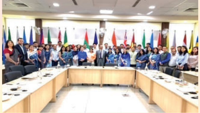
Visit to International Solar Alliance (ISA)