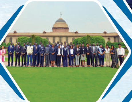
Visit to Rashtrapati Bhavan