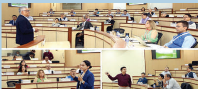
Visit to Indian School of Business, Hyderabad