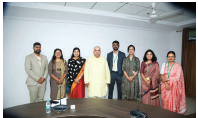
Call on dignitaries during State Attachments (Governors, Chief Ministers & senior officials) by IFS OTs