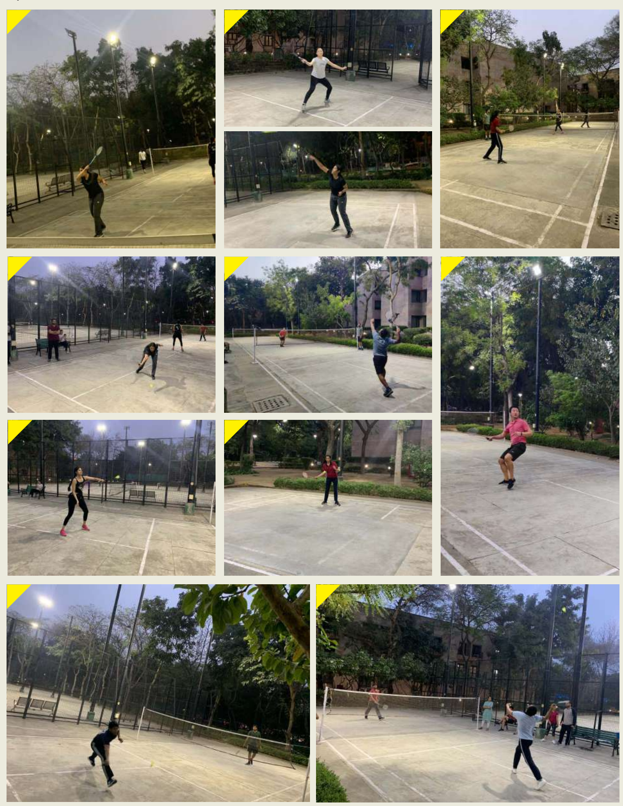
IFS OTs' sports activities at SSIFS Campus