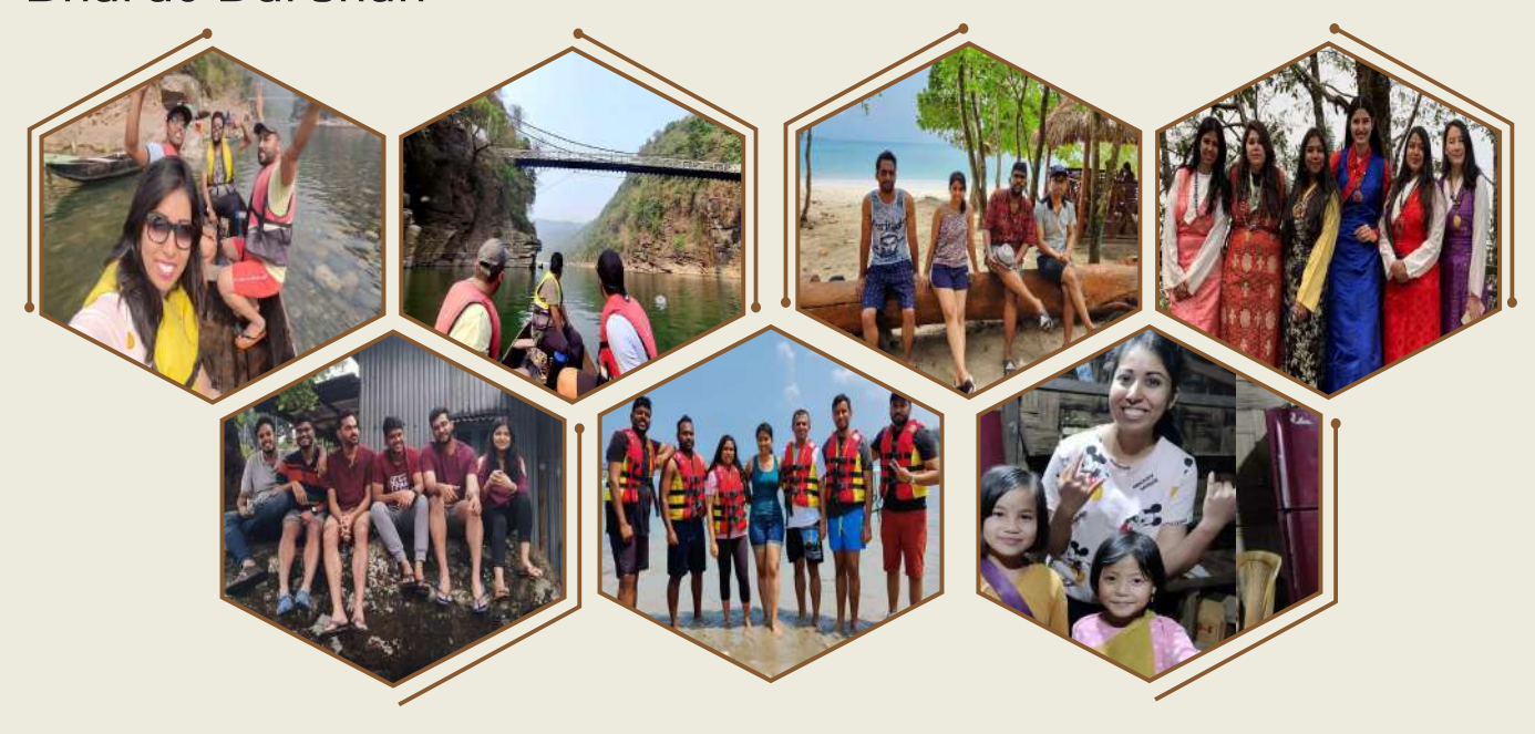
IFS\ OTs'\ visit\ to\ Andamans,\ Sikkim,\ Kolkata,\ Puducherry\ \&\ Hyderabad\ as\ part\ of\ their\ Bharat\ Darshan\ tour