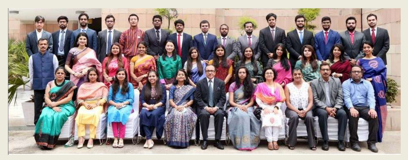
SSIFS Faculty, IFS OTs 2020 Batch & Bhutanese Diplomats