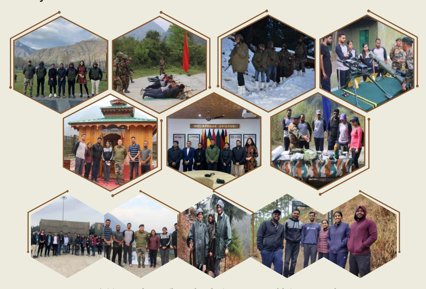
IFS OTs' visit to Bagdogra, Dibrugarh and Srinagar as part of their Army attachment