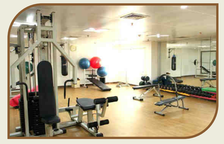
Health Club VIDESH SEWA | JUL-SEP 2019 13