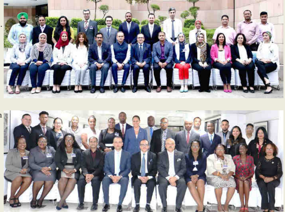
Suriname) participated in the Course. The Course was inaugurated by Dean (FSI) on 12 August while the valedictory