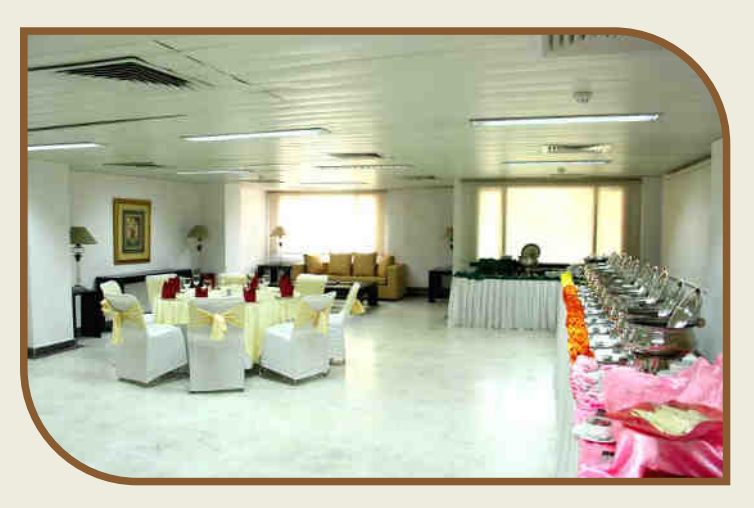
Executive Dinning Room (EDR)