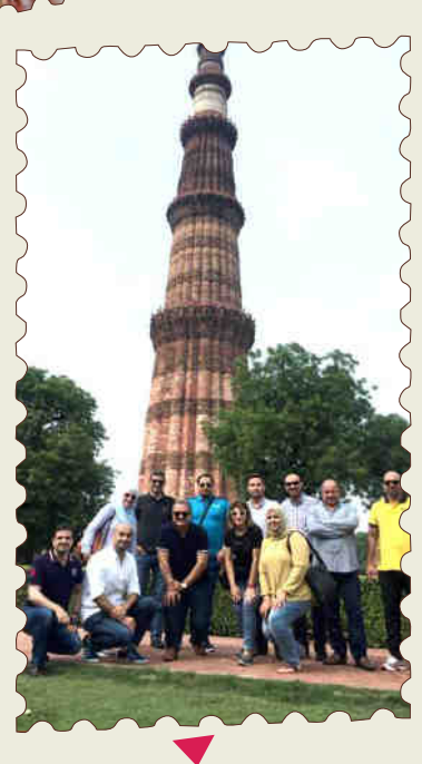
Visit to Qutub Minar by Iraqi diplomats