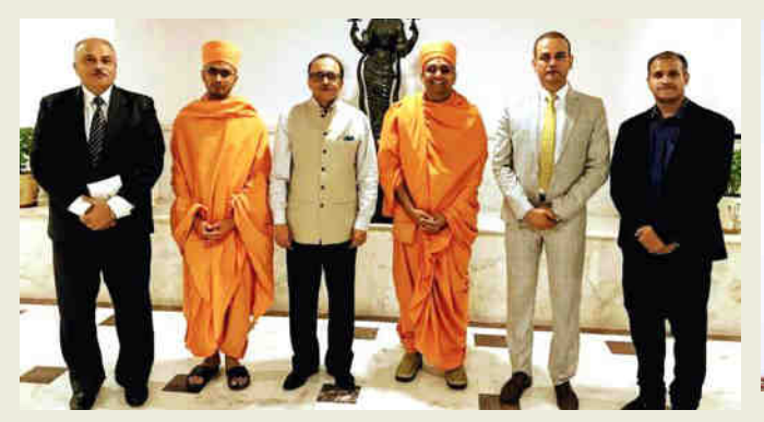
Sadhu Ganmuni Das Swami Ji of Akshardham visited FSI on 15 July. Foreign diplomats attending training programmes at FSI visit Akshardham on study tour.